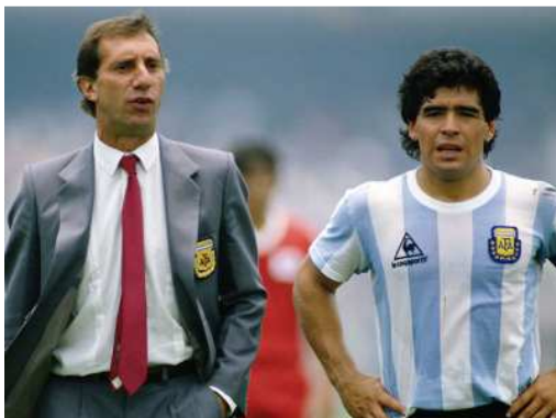
Carlos Bilardo with Diego Maradona in 1986