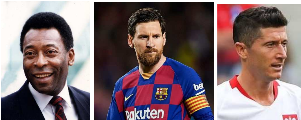
Pele (L); Lionel Messi (Centre); Robert Lewandowski (R)