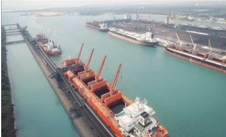
Paradip Port in Odisha