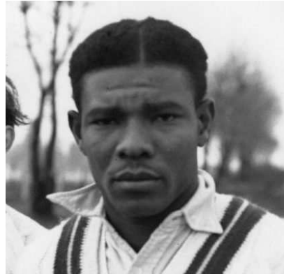
Kumar Sangakkara (L); Sir Everton Weekes (R)